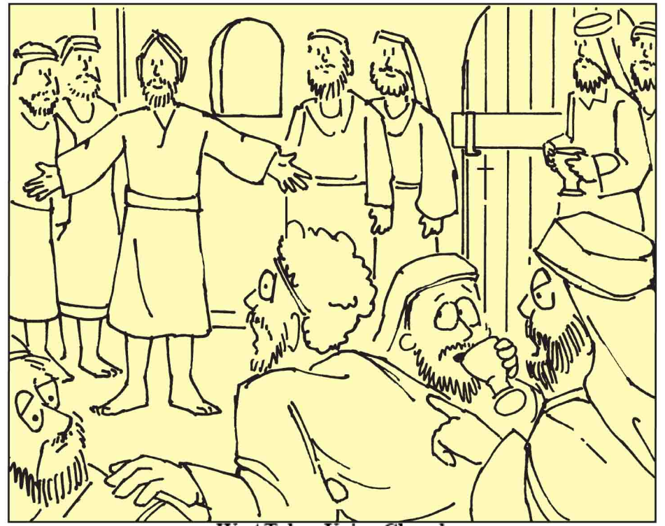
West Tokyo Union Church

Find the underlined letters hidden in the picture below. P eace b e w ith y ou.